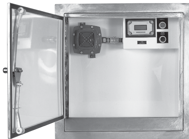
Model 2 In Wall Spill Container shown with Electronic Package No. 4 that includes an explosion proof alarm horn, alarm light, silence pushbutton, leak switch, and digital display. Standard unit is designed for single tank applications. Consult factory for other configurations.

A Model FA-S Fil-A-Larm sign is mounted on the interior of the door to alert fuel transfer personnel of the presence of the Fil-A-Larm System.